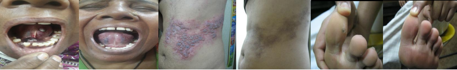
DRUG INDUCED THROMBOCYTOPENIA