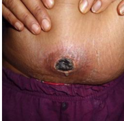
NON – HEALING ULCER