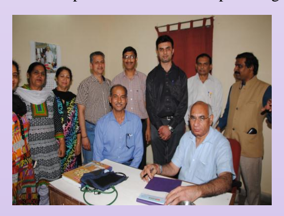
With the team and staff of IIMC