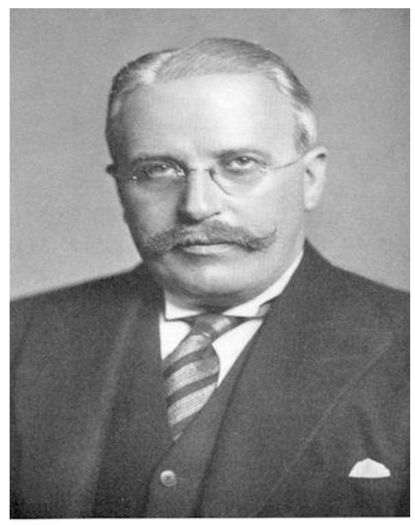
SIR JOHN WEIR, K.C.V.O. London, England

• I believe what prevents men from accepting the homeopathic principles is ignorance, but ignorance is criminal when human lives are at stake. No honest man faced with the facts of homeopathy can refuse to accept it. He has no choice. When I had to face it, I had to become a follower. There was no choice if I were to continue to be an honest man. ... Truth always demands adherence and offers no alternative.